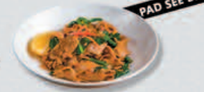
PAD SEE EW

Stir fried thick rice noodle with egg, sweet soy sauce and mixed vegetables.